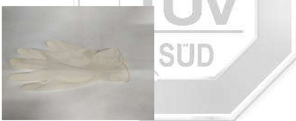
Picture 1: "Mumu Latex Powdered Examination Gloves" Sample as received

One packet of glove sample labelled as follows was received.